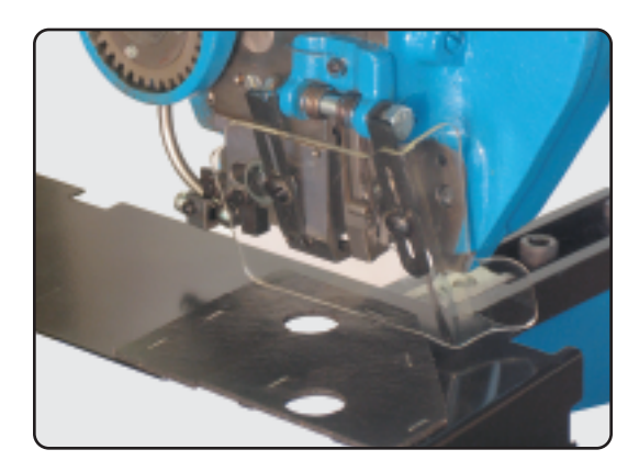
Automotive; rubber to steel